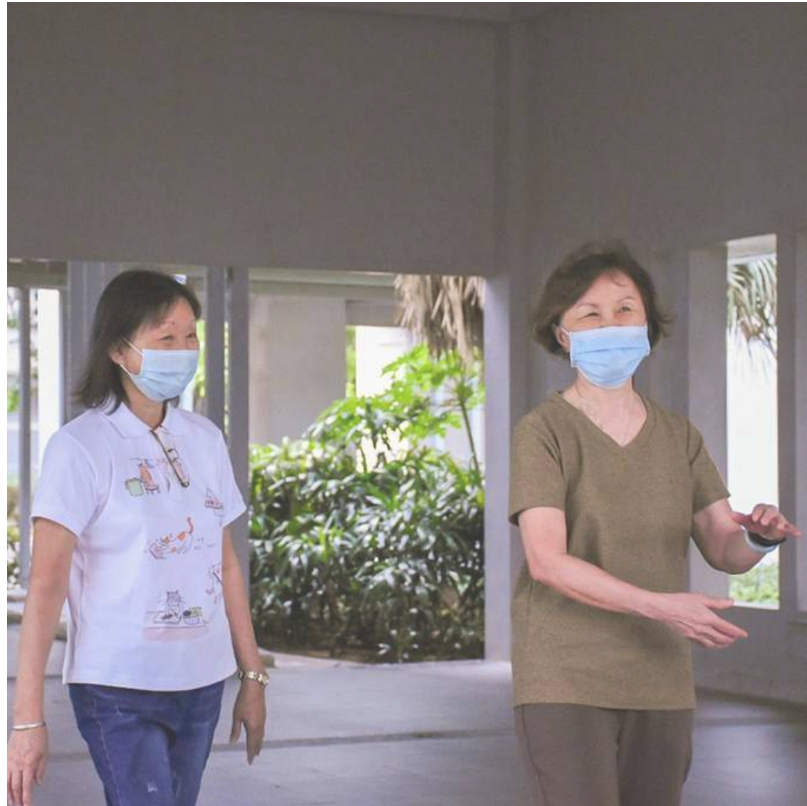
Look to the end of the photobook for a picture everyone doing taichi poses !!