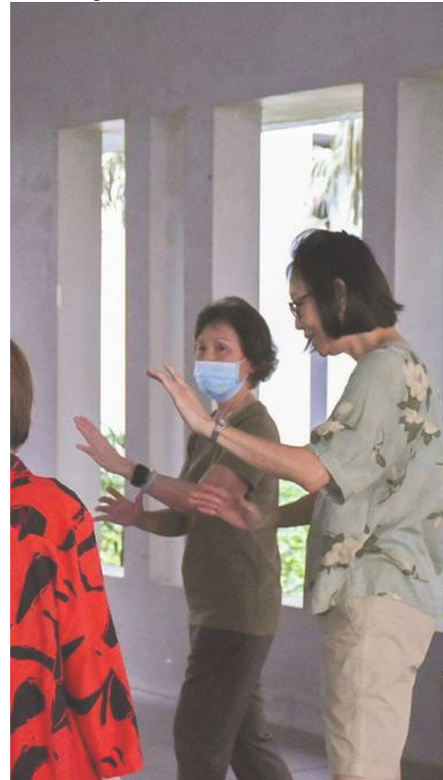
Teaching Tai Chi