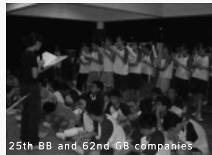
25th BB and 62nd GB companies

The boys and girls sang wholeheartedly and were received with warm applause as well as invitations from the residents to visit them again. This programme was made even more meaningful by the little gifts of their favourite "tim sum" snack and teddy bears which were given to the elderly residents. At the end of the performance, the youths also enthusiastically helped with the serving of dinner and interacted with the residents. Many gave positive feedback about the programme as it was truly an experience of a lifetime for them.