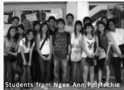
Students from Ngee Ann Polytechnic

Between January to March 2005, meetings and discussions were held with a lecturer and group of students from the School of Business and Accountancy, Ngee Ann Polytechnic, as they embarked on a mission to help us develop a multi-media presentation for our 1st Anniversary celebrations. By using this service learning pedagogy, the students not only had the "hands on" opportunity to put what they learnt in their classroom to good and practical use, it also deepened their understanding and appreciation of social and community needs through their interaction with our staff and visits to the Youth Hub.