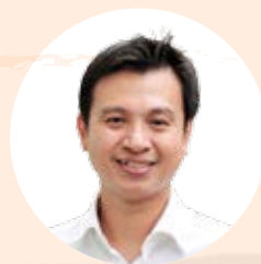
Patron since 2011 Dr Chia Shi-Lu Member of Parliament Tanjong Pagar GRC