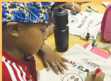
EARLY LEARNING PROGRAMME AGED 6 - 7