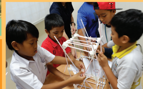
GROUPWORK, TALK & WORKSHOP