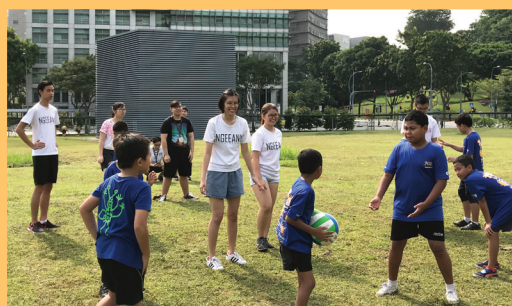
SPORTS & ADVENTURE