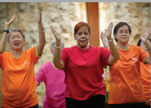
MUSIC & DANCE