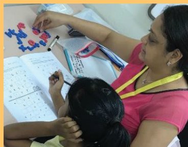
KIDSLEAP AGED 7 - 10