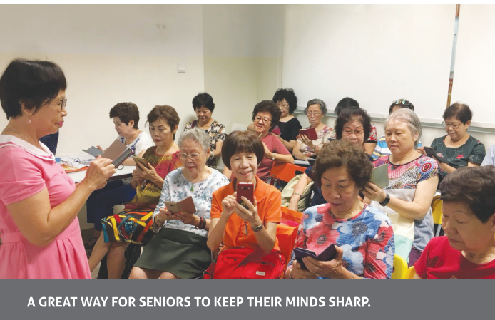
A GREAT WAY FOR SENIORS TO KEEP THEIR MINDS SHARP.