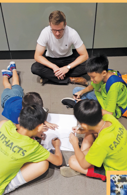
THE LEARNING HUB AGED 7 - 12