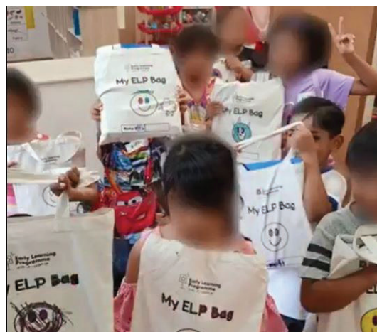
PERSONAL STUDY MATERIALS