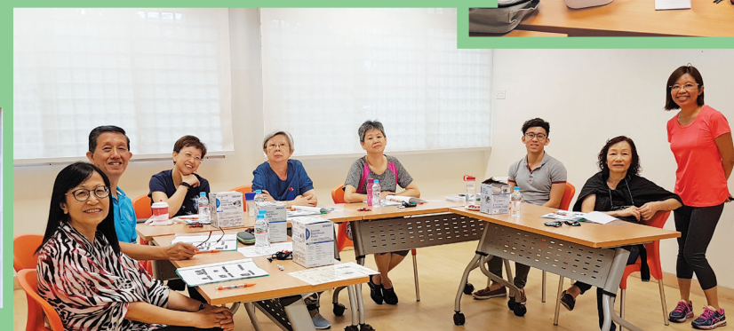
2-DAYS WOW TRAINER VOLUNTEER TRAINING