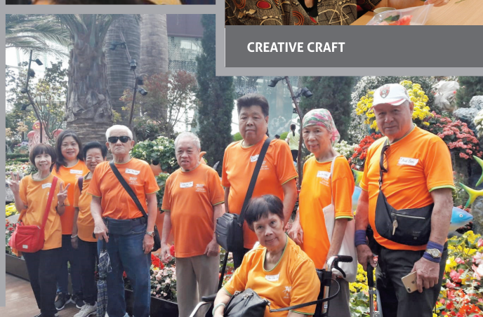
OUTING & SOCIAL