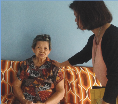
CASEWORK & COUNSELLING