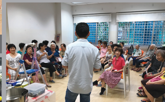
TALK & WORKSHOP