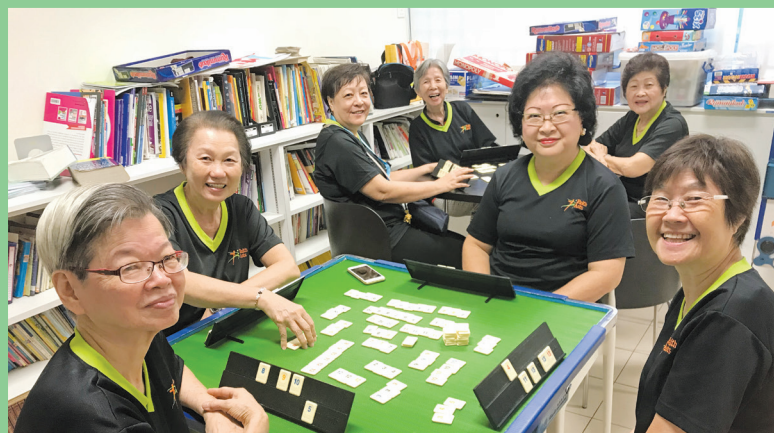
VOLUNTEERS LEARNED HOW TO PLAY THE GAME TO ENGAGE OUR SENIORS