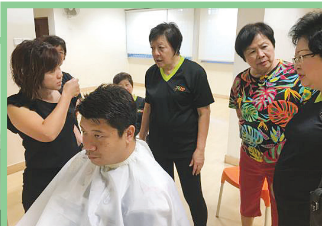
A 6-WEEKS COURSE ON HAIR CUTTING